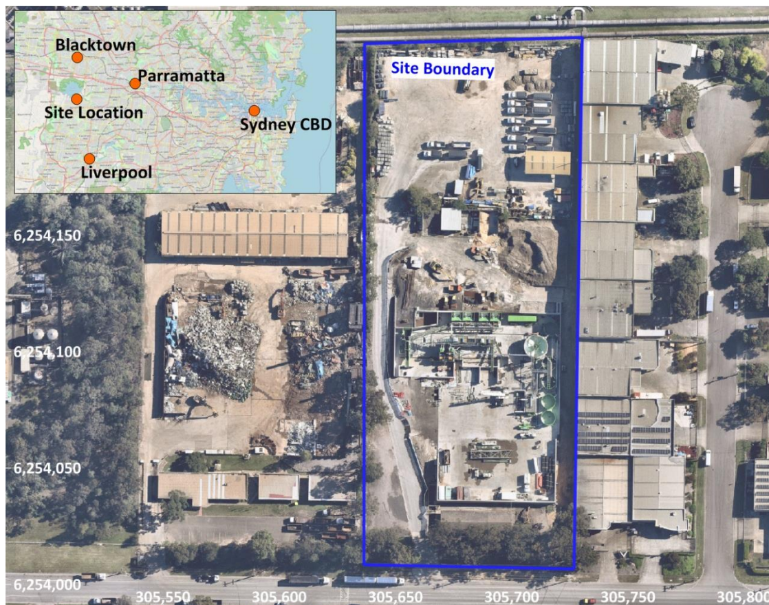
Figure 1. Site Location.

The site is approximately 10 kilometres (km) north of Liverpool, 10 km west of Parramatta, and 7 km south of Blacktown. The site covers an area of approximately 20,292 m 2 and is located within the Fairfield Local Government Area (LGA).