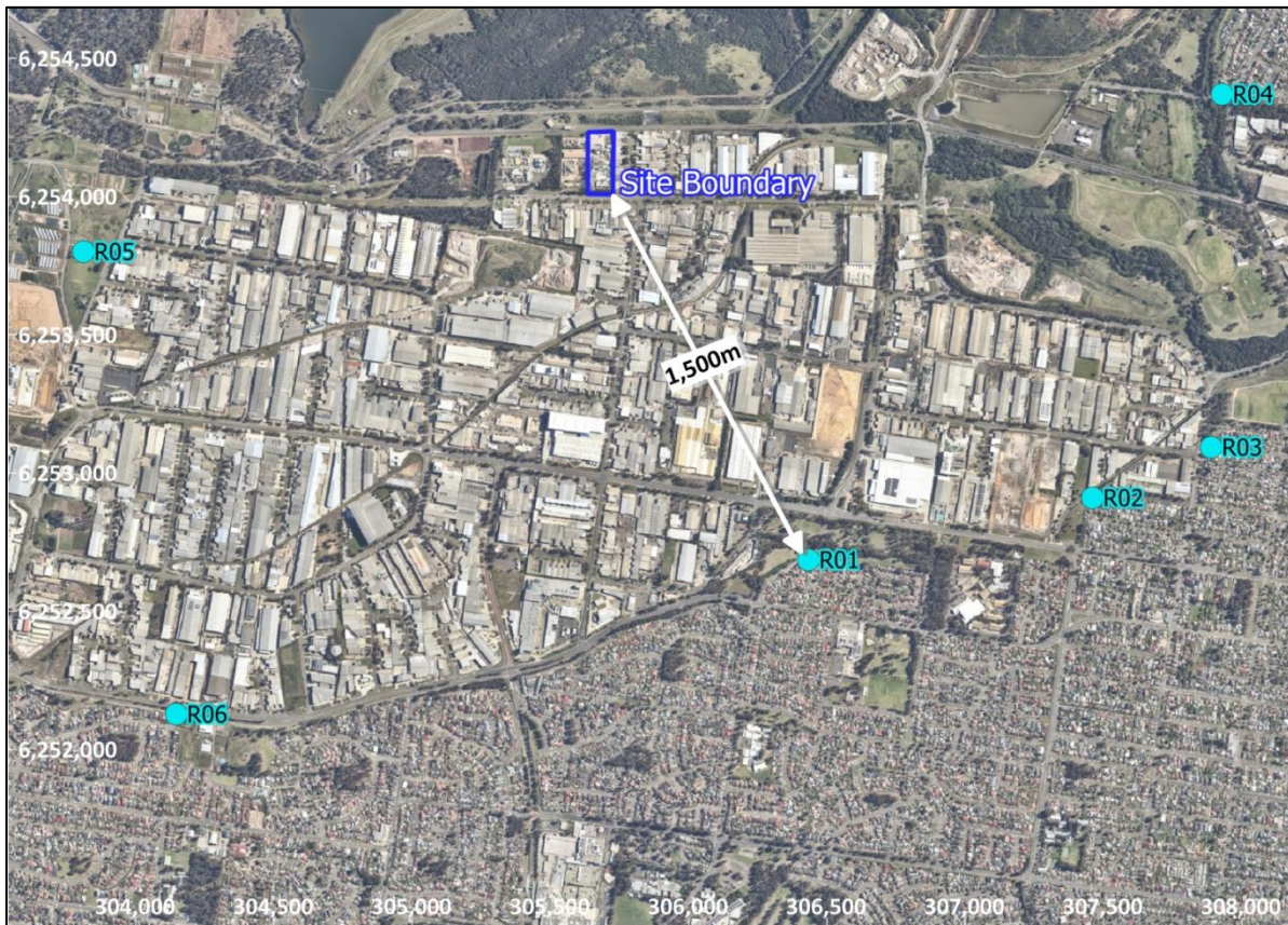
Table 6: Receptor Locations